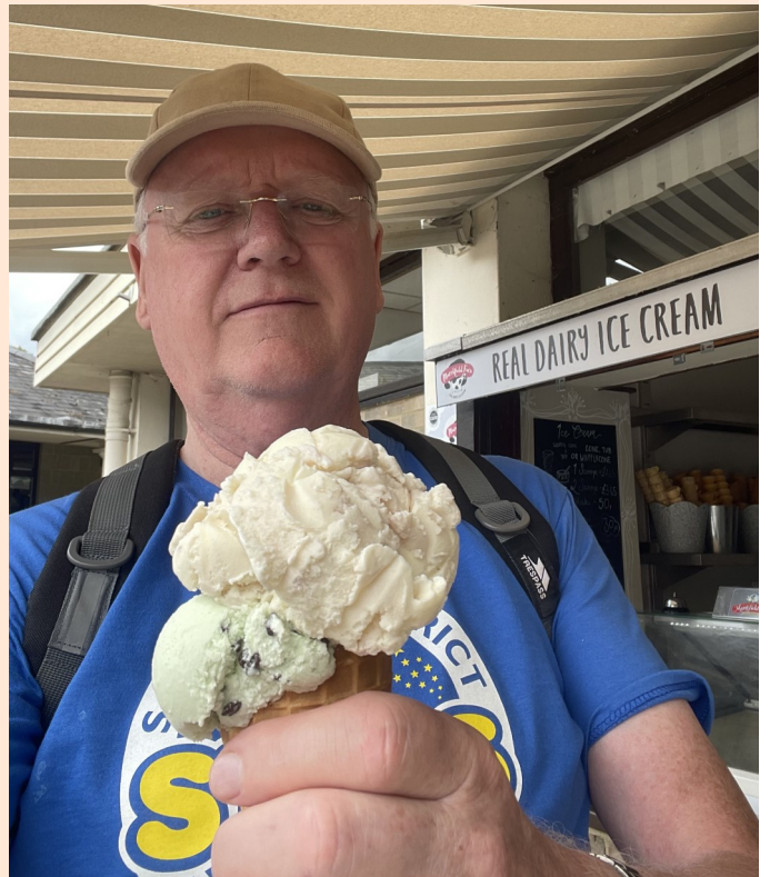
All done.....now that's better!