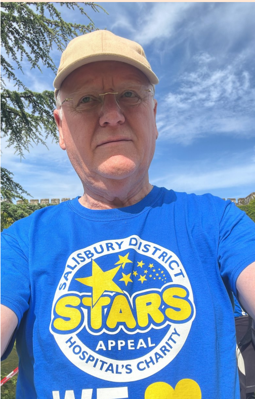
Looking determined before the "Off"