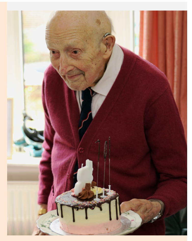
The Birthday Boy