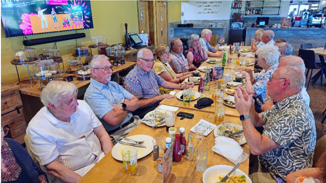
The Marnhull Lunch Party