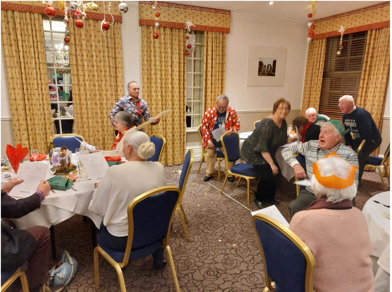
The traditional raucous rendition of “The 12 Days of Christmas” to close the evening

Your second reminder is that all future Circle Meetings now start at 7:00pm, with the aim to sit down to eat at 7:45pm. Registration will be open from 6:45pm.