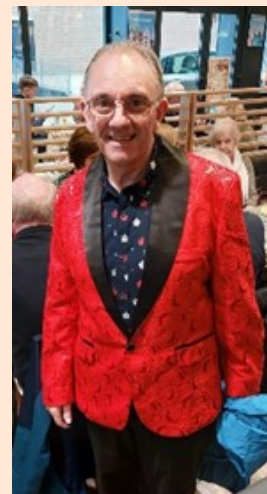
Sunday Dining Jacket Potato Evening