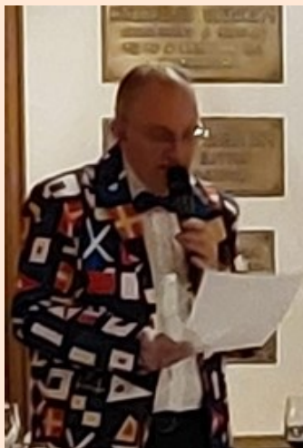
Princes Elizabeth Ship