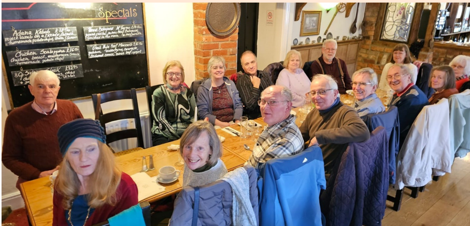
Rogues Gallery at last months Pub Lunch at the Barford Inn. Missing from the photo was Bro. Secretary who was duty photographer.