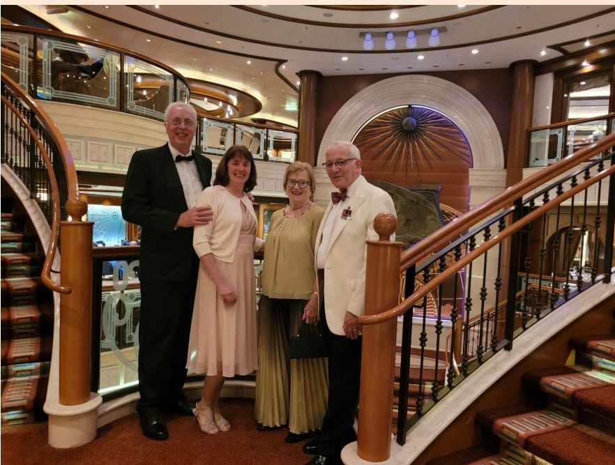
The Cruising Catenians