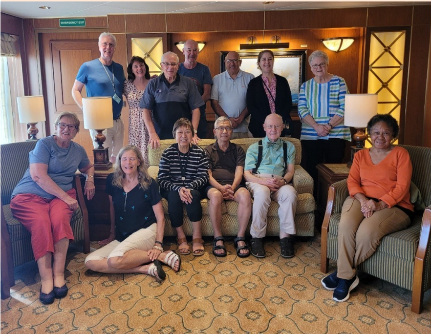
The Queen Victoria Rosary Group